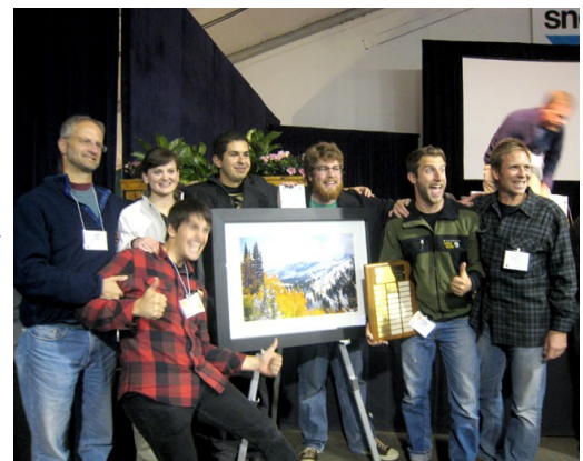
Above: HSU conclave team after their win in Utah.