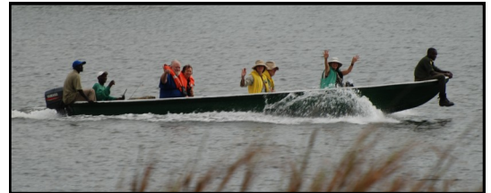
A few of the wild Humboldt tribe on the Kafue River in Zambia.

For more information check out the McBride bush camp web site: www.mcbridescamp.com , or ask one of the legendary travelers at the next annual Wildlife Chapter meeting in Riverside on Feb 10, 2011.