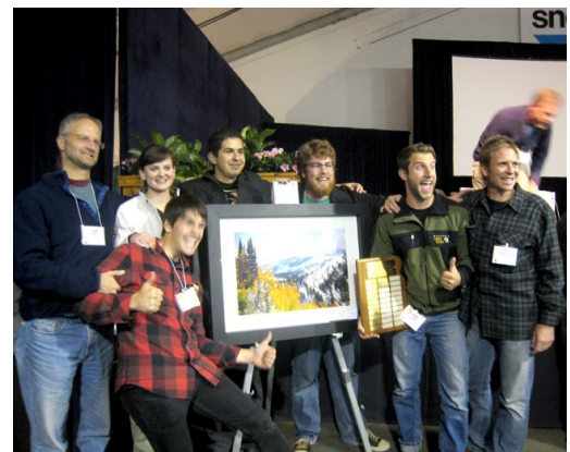
Above: HSU conclave team after their win in Utah.