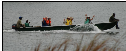
A few of the wild Humboldt tribe on the Kafue River in Zambia.

"...lions, elephant and hippo walk through the camp at night..."