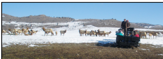
Left: HSU conclave team on a field trip in Utah.