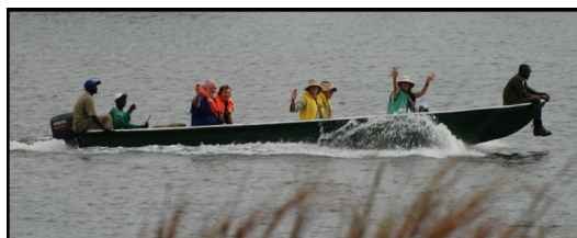
A few of the wild Humboldt tribe on the Kafue River in Zambia.

"...lions, elephant and hippo walk through the camp at night..."