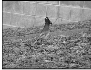
Above: A banded Steller's Jay ( Cyanocitta stelleri ) looks for a spot to cache his peanut. Jays are the focal species of 2 current Master's student theses.

The 4th annual meeting of Wildlife Chapter - HSUAA will be held in conjunction with the Western Section of The Wildlife Society conference in Visalia, CA, on January 29 from 7:30 to 8:30 am.