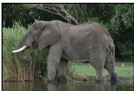
Left: An African Elephant ( Loxodonta Africana ) spotted along the Kafue River during the Humboldt Safari to Zambia.

Right: A lazy river otter ( Lontra canadensis ) at Hookton Slough of the Humboldt Bay National Wildlife Refuge Complex. River otters are currently the study organism of 2 Humboldt Master's theses and a recent Wildlife Techniques class.